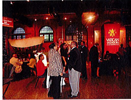
Seasonal Celebration Heinz History Center Vatican Splendors