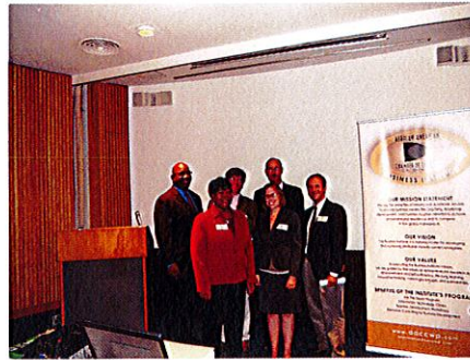
How To Do Business with Allegheny County Economic Development Regional Enterprise Tower