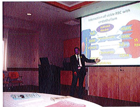
Sickle Cell Luncheon UPMC Herberman Conference Center