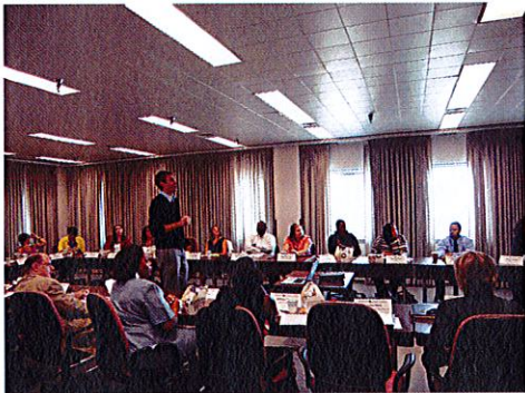
Social Media Workshop Regional Enterprise Tower