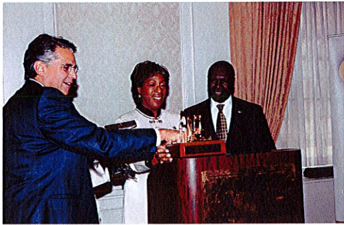
Annual Meeting & Luncheon Omni William Penn Hotel