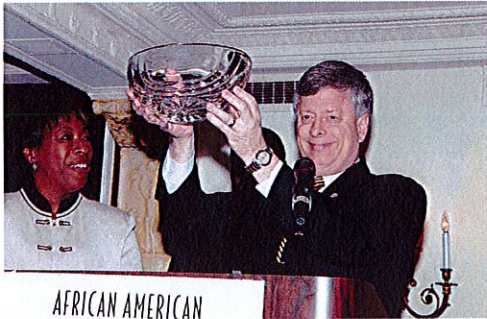
Annual Business Luncheon Omni William Penn Hotel