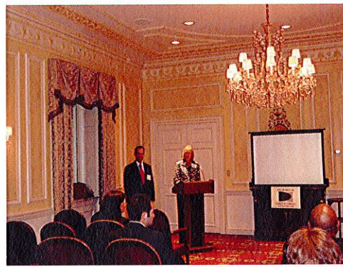
Legislative Briefing & Reception Duquesne Club