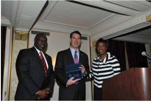
Annual Meeting & Luncheon Omni William Penn Hotel