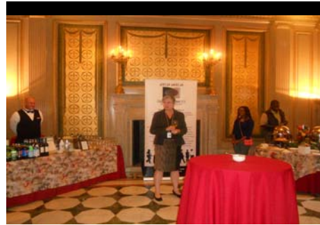
Members Mixer Carnegie Museum of Pittsburgh