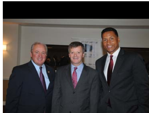
Special Breakfast Meeting Rivers Club