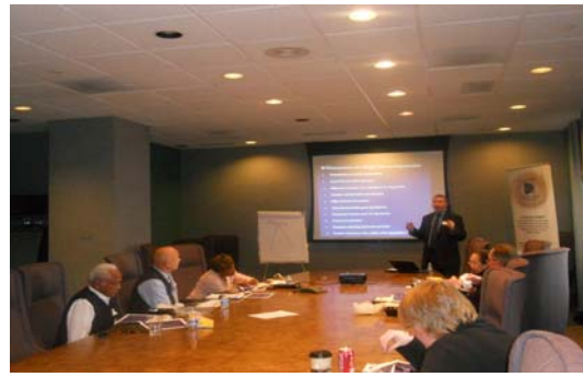
Strategic Planning Workshop Koppers Building