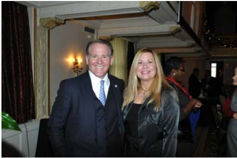
Annual Business Luncheon Omni William Penn Hotel