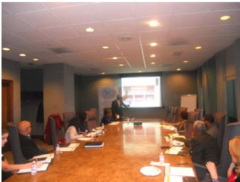
How to do What you do Successfully Koppers Building