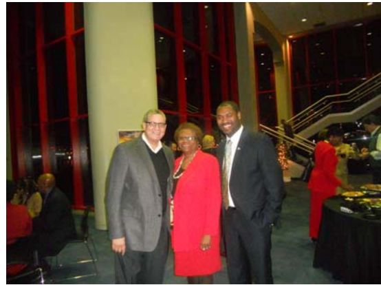
Seasonal Celebration Carnegie Science Center