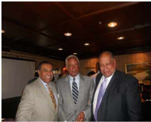
PowerBreakfast Meeting Rivers Club