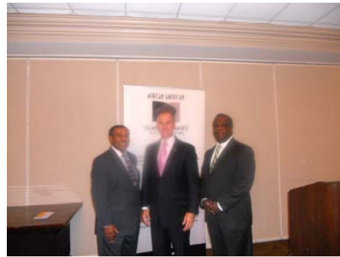
Special Breakfast Meeting Rivers Club