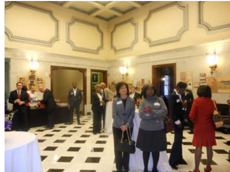
Members Mixer Dollar Bank