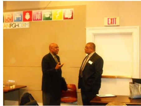
How to do Business with the Housing Authority of the City of Pittsburgh Housing Authority Conference Room