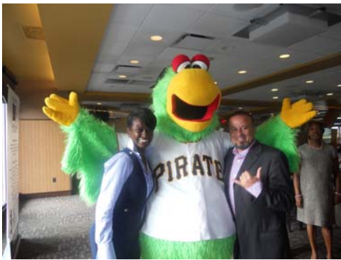
Members Mixer PNC Park