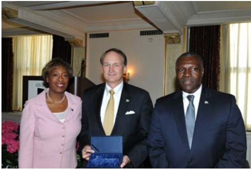
Annual Meeting & Luncheon Omni William Penn Hotel