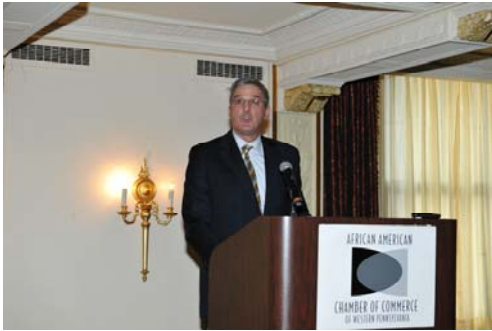
Annual Business Luncheon Omni William Penn Hotel