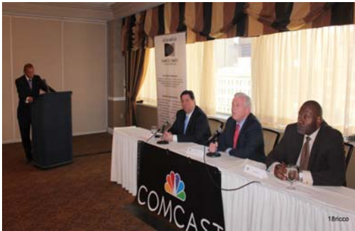
Mayoral Candidates Forum Rivers Club