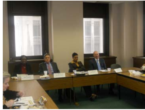
Financial Planning Workshop Koppers Building