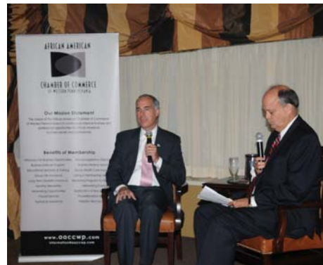
Business Breakfast Meeting U.S. Senator Robert Casey, Jr. Rivers Club