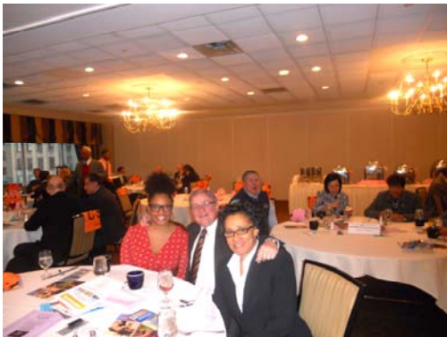
PowerBreakfast Meeting Rivers Club