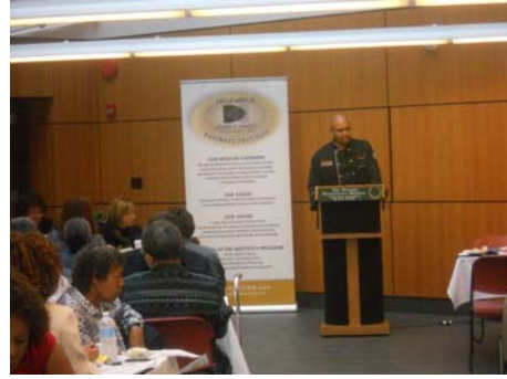
Diabetes Workshop VII West Penn Hospital