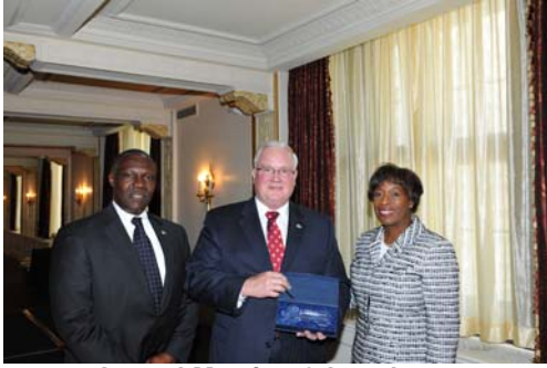
Annual Meeting & Luncheon Omni William Penn Hotel