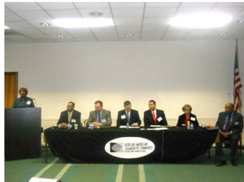
Marcellus Shale Workshop Koppers Building