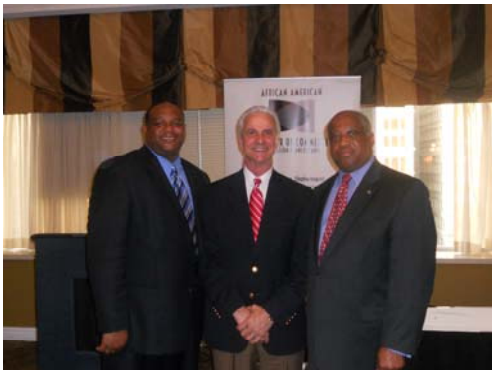
Candidates Forum – PA House of Representatives Rivers Club