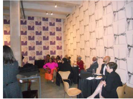
Seasonal Celebration The Andy Warhol Museum Warhol: Headlines