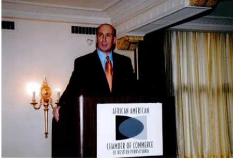
Annual Business Luncheon Omni William Penn Hotel