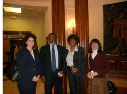
Seasonal Celebration Frick Art & Historical Center Faberge Exhibit