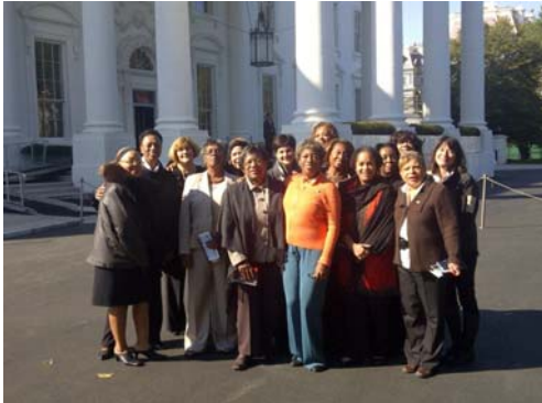
White House Trip White House