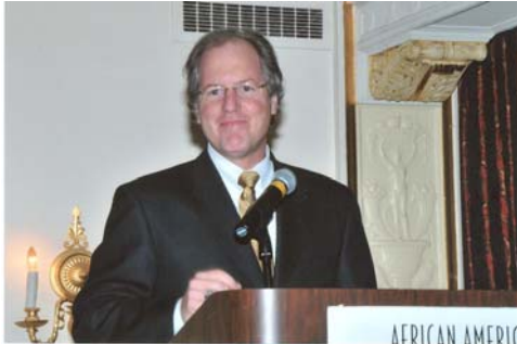
Annual Business Luncheon Omni William Penn Hotel