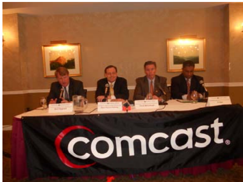
Candidates Forum – County Chief Candidates Rivers Club