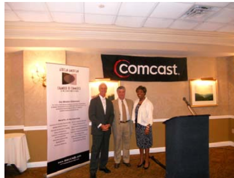
Special Breakfast Meeting Senator Wayne Fontana Rivers Club