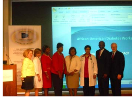
Diabetes Workshop III Allegheny General Hospital