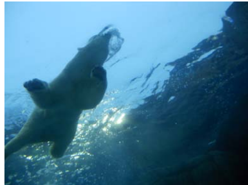
Networking Mixer Pittsburgh Zoo & PPG Aquarium